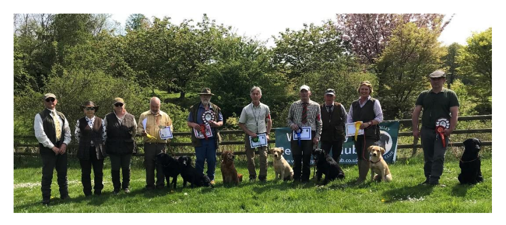
Special Puppy and Veteran Winners with the Judges - Working Test at Lulsley on 30 April