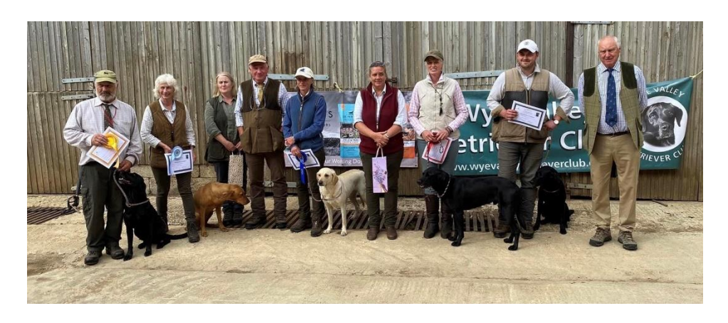
Open winners - Working Test Manor Farm 23 July