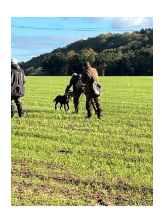
Another bird safely in!