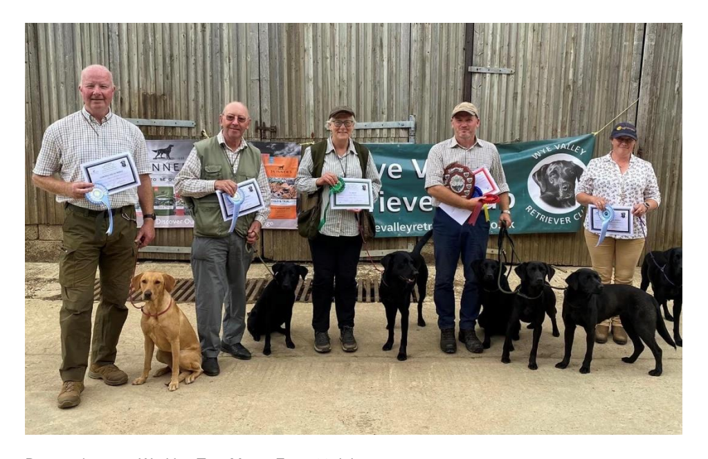
Puppy winners – Working Test Manor Farm 23 July