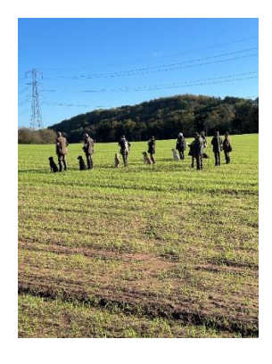
The left side of the field at Tin Hut

We will be holding a Twelve Dog Open Field Trial at the Batsford Estate, Moreton in Marsh on Monday 16 January 2023.